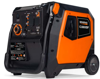
Photograph may not represent actual content.