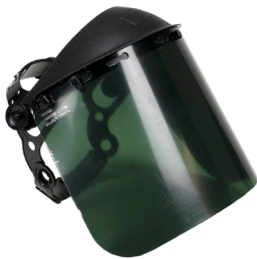
ITEM# 58604 Face Shield with Pin-Type Headgear, Green