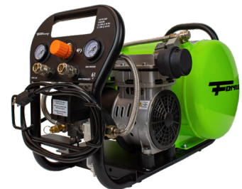
ITEM# 550 Fornair® 1.0 HP, 4 Gal, Oil-Free Air Compressor, 120 PSI, 2.5 CFM