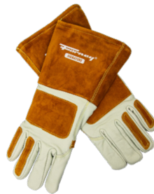
ITEM# 53408 Forney® Signature Cowhide Welding Gloves (Size M)