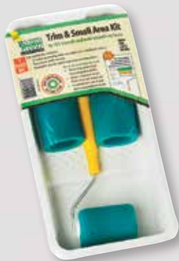
KLEEN & GREEN™ TRIM & SMALL AREA PAINTING KIT Contains 3" roller handle and three 3" roller refills, plastic paint tray and 2 paint tray liners. #201 Kleen & Green Trim & Small Area Painting Kit (7 pieces) Packed 18 per carton