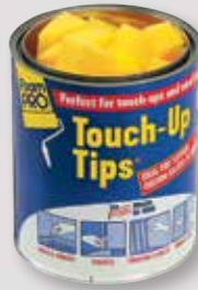
TOUCH-UP-TIPS™ Wedge-shaped foam tips are ideal for nicks, scratches, chips and for touch-ups. #42 Touch-Up-Tips Packed 100 per 1-gallon paint can