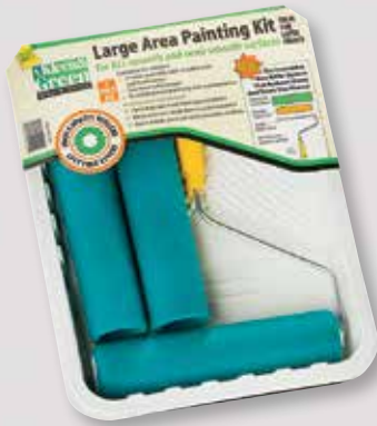
KLEEN & GREEN™ LARGE AREA PAINTING KIT Contains 9" roller handle and three 9" foam sleeves, large plastic paint tray and 2 paint tray liners. #200 Kleen & Green Large Area Painting Kit (7 pieces) Packed 12 per carton