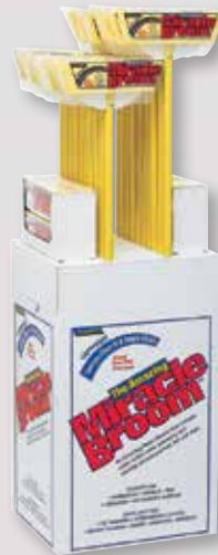
MIRACLE BROOM, REFILLS & DISPLAY 12" wide foam broom sweeps clean with a single stroke without "sift through" of particles. Creates "static action" that attracts dust, lint and pet hair. Perfect for wood, tile, marble, vinyl & smooth concrete floors. #55 Miracle Broom (12/case) #50 Miracle Broom Refills (12/case) #MBD1 Miracle Broom Display Contains 20 Miracle Brooms, 12 refills in floor display