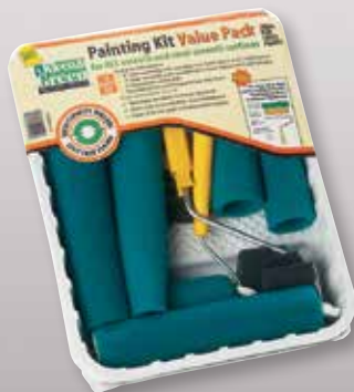
KLEEN & GREEN™ PAINTING KIT VALUE PACK Contains 9" roller handle and 3 foam sleeves, 3" roller handle and 3 foam sleeves, 2" foam brush and 3 refills, large paint tray and 2 tray liners. #202 Kleen & Green Painting Kit Value Pack (15 pieces) Packed 10 per carton